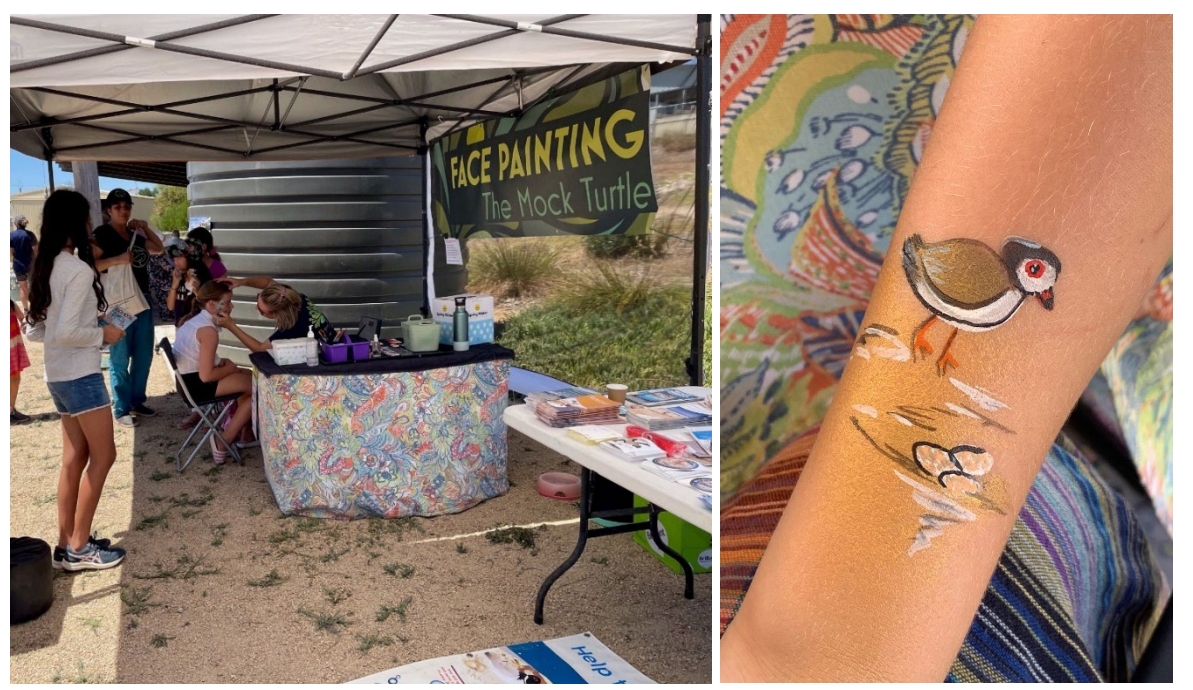
Facepainting at the launch! The face painter created a special Hooded Plover design for the event.