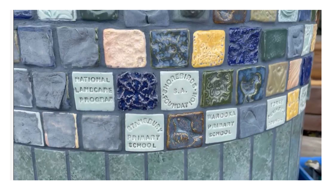
Finishing touches on the tiles created by the students and community. Each funder and contributor has a tile, including SA Shorebirds Foundation.