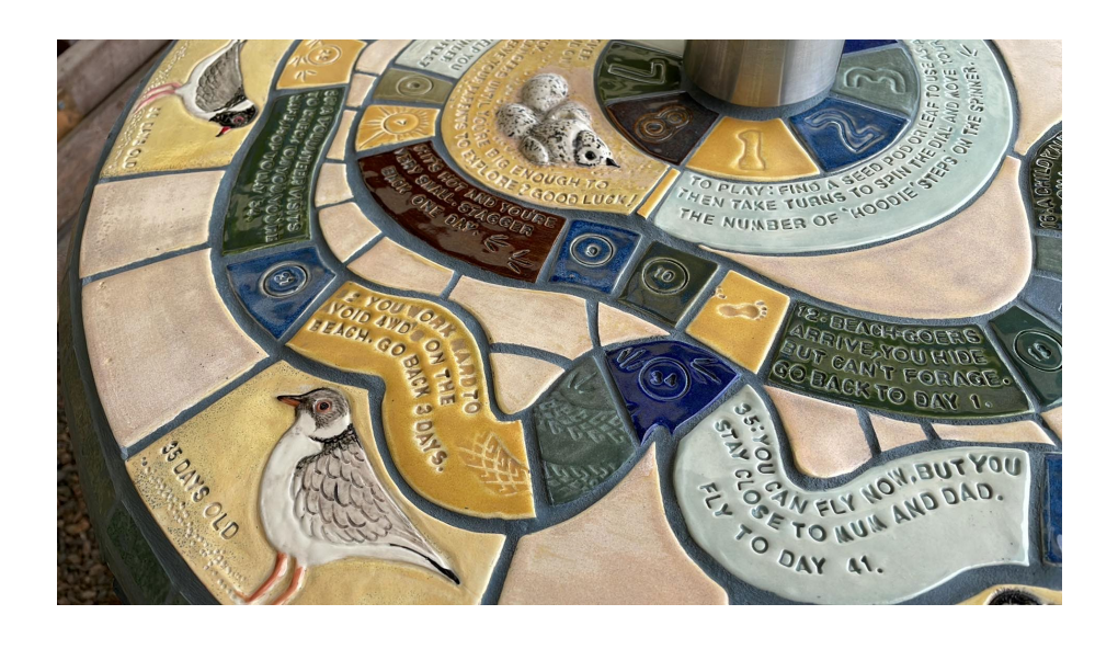
Close up of the glazed and fired tiles for the game on the top of the Hoodie Play Pod.